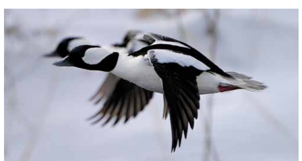
Buffleheads in the Snow